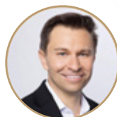
David A. Sinclair , AO, PhD, Professor of Genetics, Harvard Medical School