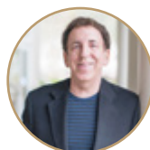
Dean Ornish , MD, Founder & CEO, Ornish Lifestyle Medicine