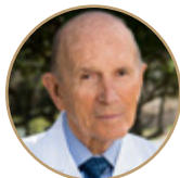
Kenneth H. Cooper , MD, MPH, Founder and Chairman, Cooper Aerobics

We express our appreciation to the experts who participated in the Longevity Clinics Roundtable Conference, listed alphabetically: