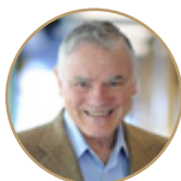
Leroy Hood MD , PhD, Professor and Chief Innovation Officer at the Buck Institute and CEO of Phenome Health