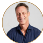
Mark Hyman , MD, Founder & Senior Advisor: Cleveland Clinic for Functional Medicine